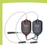
Insert earphones IP30