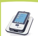
easyScreen device with cradle

Specifications are subject to change without notice.