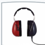
AC headphone DD65 v2