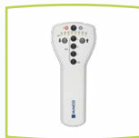
MA 1 handheld device